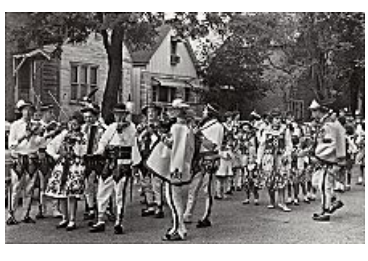
POLISH MOUNTAINEERS' PARADE, 1965

In the period between the fire of 1871 and the Great Depression, Chicago grew from a regional center to the second largest city in the country, the most important rail hub in the country, the seat of many of the largest heavy industrial plants, and the destination for hundreds of thousands of European immigrants. The so-called new immigration of Southern, Eastern, and Central Europeans transformed the social geography of Chicago and most other great cities in the United