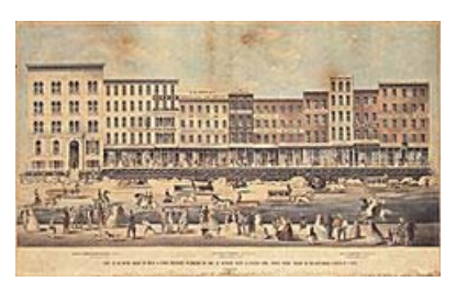
STREET RAISING ON LAKE STREET, 1855

The arena of community-building activity was not at all the same thing as the built-up area or even the municipality. By the time of the fire of 1871, "Chicago" included not only the continuously developed area within about a mile of the river's mouth but also a wide array of residential suburbs, manufacturing communities, quarry villages, rail yard settlements, and market-gardening centers that merged gradually into the sprawling