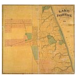
MAP OF LAKE FOREST, 1873

hinterland becoming rail-linked to the city. Historian William Cronon has shown how Chicago's metropolitan growth was symbiotic with a dramatic transformation of the environment for hundreds of miles around. In a more deliberate way, Chicagoans were also transforming the environment in and close to the city. Partly through necessity, partly through competitive zeal, Chicago's elite moved quickly to use new technology in refashioning the city, creating what Cronon calls "second nature" not only on the former prairies of Iowa but also in the former marshes of downtown. Beginning in the 1850s the city undertook a decades-long project of raising the grade of its streets to allow for the building of sewers. Under the guidance of engineer Ellis Chesbrough, Chicago became an internationally known experiment in water management. First in planning for drainage, and then in the 1860s in the cutting-edge water supply system that drove a tunnel under Lake Michigan and set up the Water Tower and Pumping Station on the North Side, the city authorities began a century-long process that would remake the hydrological profile of an area hundreds of square miles in extent.