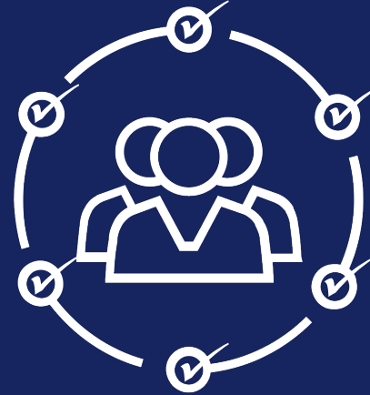
Community performance monitoring