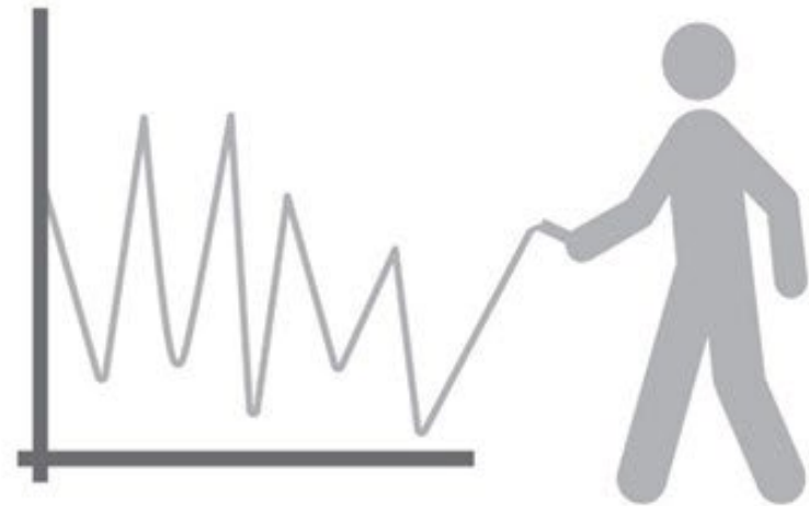
DEMAND FLUCTUATES DAILY AND WEEKLY