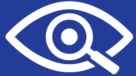
Illegal/suspicious activity monitoring