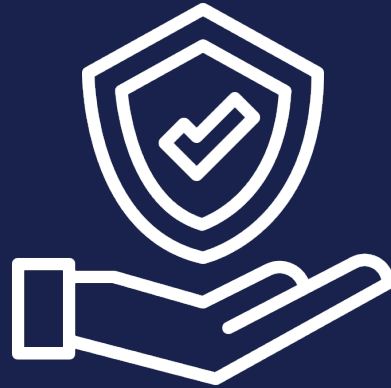
Insurance and compliance monitoring